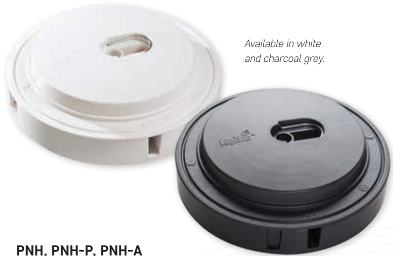
Available in white and charcoal grey.