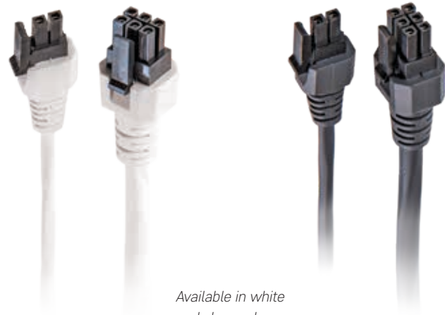
Available in white and charcoal grey.